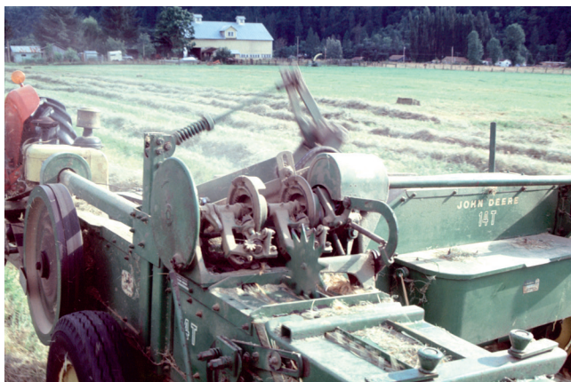
Slide 15. Proper adjustment of knotters and plunger will increase bale production per hour.

Check if the baler is properly picking up the windrow and avoiding foreign material. Are the bale ties spaced correctly on the bale? [Slide 16] Are you making those infamous “banana” bales because tension is not equal on both sides? Check the weights on some of the bales to see if they are the desired size and weight. [Slide 17] Two popular bale weights in the region are about 50 to 55 pounds for lighter bales and 75 to 80 pounds for heavier bales. Most westside hay buyers dislike bales heavier than 80 pounds. Bale density is dependent upon forage composition to be baled. [Slide 18] Second-cutting bales will likely be heavier than first cutting because legumes will contribute more to the bale in second cutting compared with the first. The density of the bale should be such that the ties leave a gap of about 1 inch. If the gap is greater than 2 inches, the bale chamber tension cranks need to be adjusted to increase the density.