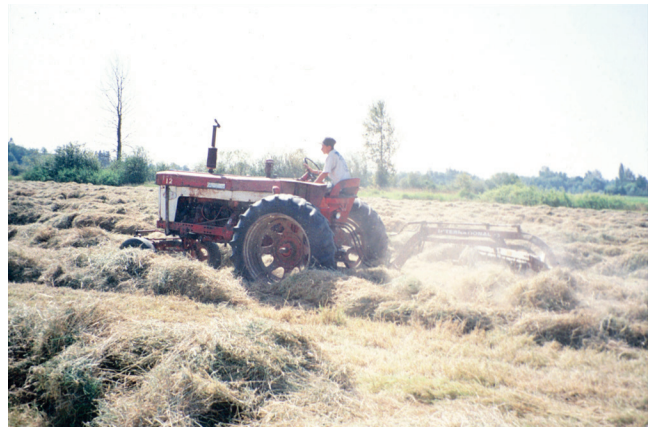
Slide 13. Windrow produced by a hay rake.