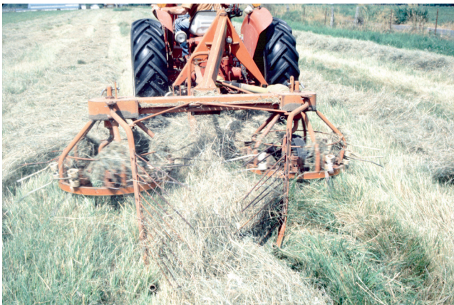
Slide 11. The tedder is making a windrow. The windrow is being moved from the damper area to the dry wheel tracks area.

If the forage was too wet to windrow in the afternoon of day two, this forage should be ready for windrowing the afternoon of day three. Again, check both the swath and windrow to see if desired moisture level is about achieved. Raking into a windrow on day three at 3pm, or mid-afternoon, will establish haymaking the next day.