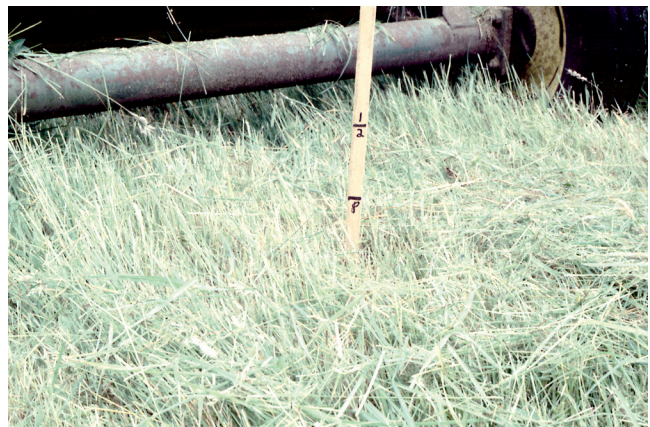
Slide 5. Cutting stubble height shown. It is best to leave about 6 inches of stubble after cutting so the grass hay can lie on the stubble surface for rapid drying. Cutting as low as 2 inches places the hay closer to the soil surface and will increase the time needed for drying.

For example: (1) Harvested forage must dry while lying nearly in contact with the wet soil surface. The