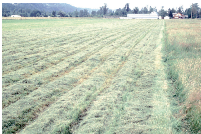
Slide 7. New-mown grass on left side for drying. On right side this grass will be mowed the following day if the high-pressure system persists. Notice the wheel tracks area is open and the stubble is drying as well as the mowed grass. During the tedding and windrowing this wheel track area will be needed to move the cut grass to a dry area for further drying.

at a time when water conservation is most needed. (3) More weed seeds will germinate because of more exposed soil.