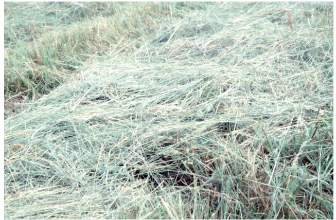
Slide 12. Windrow produced by the tedder.