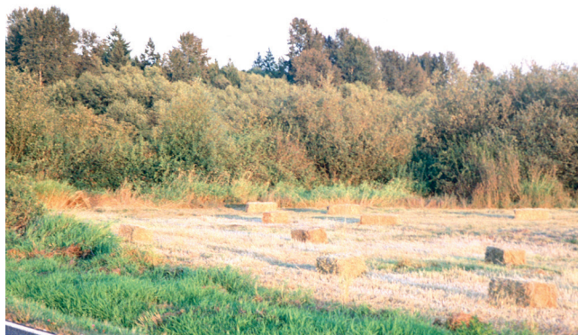
Slide 19. In problem spots such as corners, low and shady areas, extra care will be required for sufficient drying.

Hopefully you're wondering, "What do I do if my forage does get rained on before it is baled?" That's a great question. The answer is simple. Wet forage must be moved frequently. After the top of the swath or windrow dries, get the tedder out and quickly ted the forage to a drier area. The open stubble surface and soil will be drier than where the wet swath or windrow is setting presently. Too often these showers come in the afternoon. Many stop before dark. When the afternoon shower stops, get out and ted as soon as the top forage surface has dried. If this was a single rain shower event the next morning should be clear. Let the dew and moisture evaporate and pick up the process of either day two or three. If it rains for several days in a row all is not lost. Yes, many nutrients have been washed away, but you can still prevent blacken-