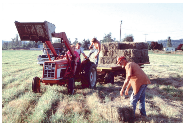
Slide 17. Pick up bales the same day they are produced. Get them under cover to prevent rain damage.