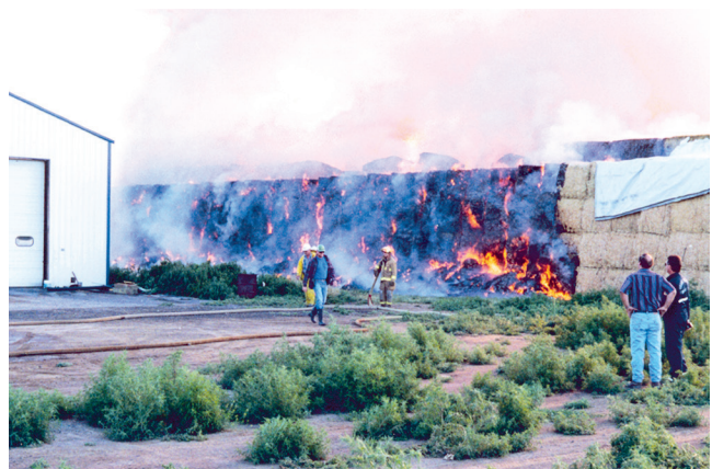
Slide 20. Spontaneous combustion from wet hay caused this haystack to catch fire and burn near Ephrata, Washington.

There is a smooth side and a cut side on every bale. The cut side is very sharp where the forage is cut during bale formation. This cut side, not the smooth side, of the bale should be the side that is faced down. If storing hay outdoors, and with the ties out, on a concrete, gravel, or soil base, the bottom tier of bales will likely be lost due to moisture absorption and bad weather. Moisture is the most aggressive and destructive enemy once the hay is stored. Storage is the final step, but if done improperly, expect to have problems and all previous efforts and investments will have been wasted.