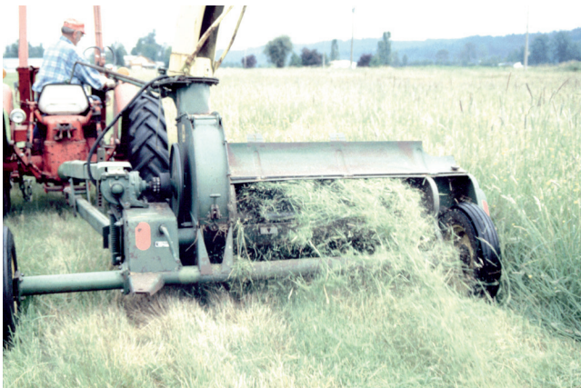
Slide 4. Hay mowing with flail chopper. In the process of cutting, many of the stems and leaves are broken. This facilitates rapid drying in the field. A drum mower will be just as effective in conditioning the grass hay.

If you have livestock, another key for success is early grazing to delay seedhead elongation. [Slide 4] The first-cutting hay produces the highest tonnage of the growing season. If the goal is high quality first-cutting hay, then several management options are possible. Graze the hay land in the spring, until mid-April in western Oregon and early to mid-May in western