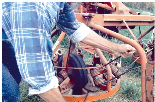
Slide 10. Adjusting the tedder. The tedder is adjusted from spreading the mowed grass to making a windrow.