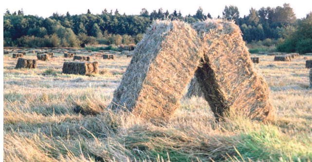
Slide 18. If all the bales cannot be removed from the field the same day they are produced, then stack them upright to minimize the ground contact.