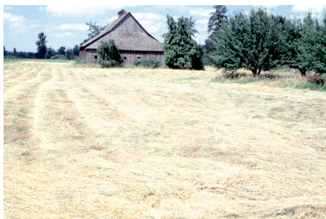
Slide 8. A grass hay field cut using a sicklebar mower. Notice the blanket-like appearance resulting in trapped moisture from the cut stubble and the soil surface. The stems are fully intact and lying in one direction. First-cutting grass mowed with a sicklebar will take longer to dry down than grass drum-mowed or flail-chopped.

Many hay producers only have a sicklebar mower for cutting hay. For first cutting this is not the best equipment to use, but it is acceptable for second cutting. Harvesting the first cutting requires the forage to be processed in some manner. You will have more success with a disc mower, a mower-conditioner or similar harvesting equipment that mechanically alters and conditions the forage and spreads the forage out widely for rapid dry down. Conditioning means the breaking or bending of stems which allows moisture to escape more rapidly [Slide 6]. First cutting often has a higher percentage of hay yield in stems (higher in water content) than leaves, hence takes longer to dry. First cutting is also the highest hay yield of the season, so there is more volume to dry [Slide 7]. Sicklebar mowers do not break or condition the stems, [Slide 8] adding more days of drying and increasing the risk of rain damage. Sicklebar mowers also leave the harvested forage covering the total mown surface like a blanket. This lack of open stubble and soil surface hinders the drying process. In second cutting, hay yields are less than the first, weather conditions are drier, plants are normally drier and we get more sunshine. However, second-cutting hay still cannot be put into windrows until the forage is dry, just before baling.