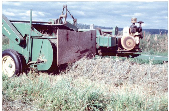
Slide 14. Windrowing and baling must take place on the same day to prevent rehydrating.