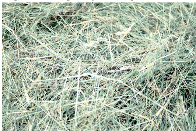
Slide 6. Cut grass hay shortly after mowing. Notice the high percentage of stems that have been broken through the mowing process. Broken stems will lose water more rapidly than intact stems.

forage stubble residue is recovering from cutting so these tissues continue to lose water through the cut area. Simply put, the distance between the soil surface and the cut edge of the stubble residue is too short. Short stubble height limits the ability for the newly fresh cut grass to lose water. When water loss is limited then the drying rate is slower compared with a 6-inch stubble height, [Slide 5] thus slowing the drying time and increasing the odds of the hay getting rained on. (2) Crop-regrowth after drying first cutting will be slower when first cutting is mowed at 2 inches rather than 6 inches because energy reserves in stem bases were removed at harvest. Regrowth yields can be reduced because of water evaporation from prolonged soil exposure to the sun