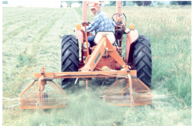
Slide 9. Tedding grass. The tedding process fluffs and repositions the grass hay to increase air penetration and circulation into the forage. Ted after the morning dew has evaporated. Note: the drying process must be mostly completed through tedding before being windrowed.