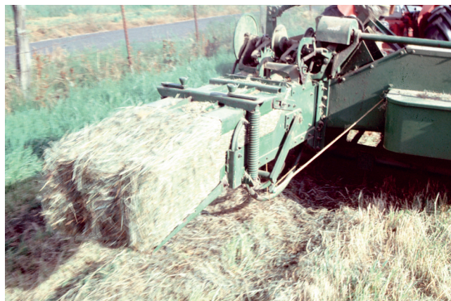
Slide 16. The finished product.