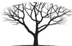
NOT THIS (Incorrectly Pruned)

If a particular plant becomes too aggressive in your rain garden, it is perfectly fine to replace it or remove it.