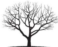
BEFORE (Unpruned Tree)

After the first two years, your rain garden plants might need annual pruning or branch cutting to keep vigorous vegetation in control and away from roads and walkways. Pruning should be done in the early fall, so that plants have time to recover before freezing weather. If you don't want to prune regularly, consider plant choices that are smaller and more compact (ask your local nursery for suggestions or consult the Rain Garden Handbook at www.kitsapgov.com/pw/raingardens.pdf ).