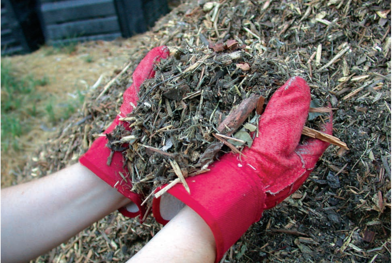
Mulch prevents weed growth and keeps soils moist

often you need to water. Mulch will keep plants' roots cooler as the weather heats up, benefitting plant health.