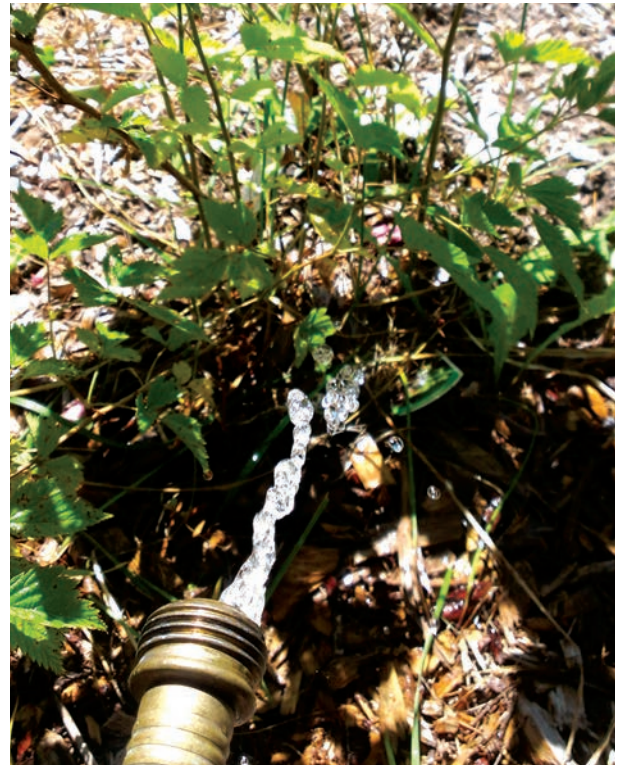
Watering the roots

Overwatering and light/infrequent watering should both be avoided because plants will