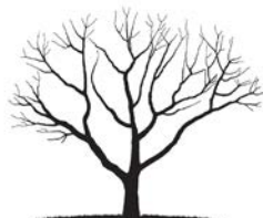
THIS (Correctly Pruned)