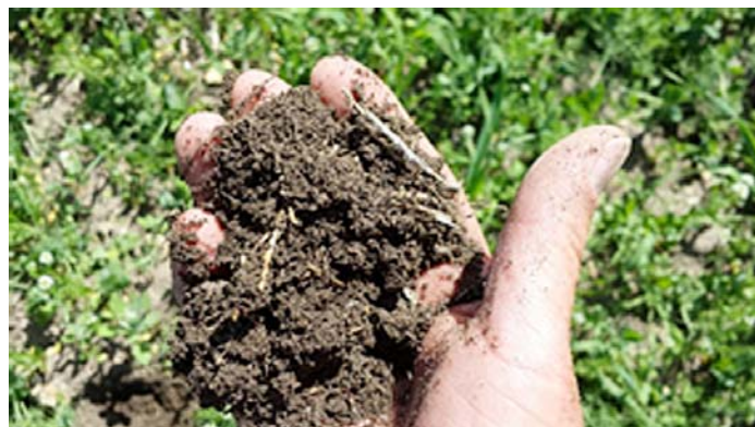
Figure 2. Aggregation, root mass needing improvement.