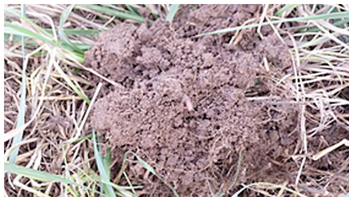
Figure 1. Excellent aggregation.