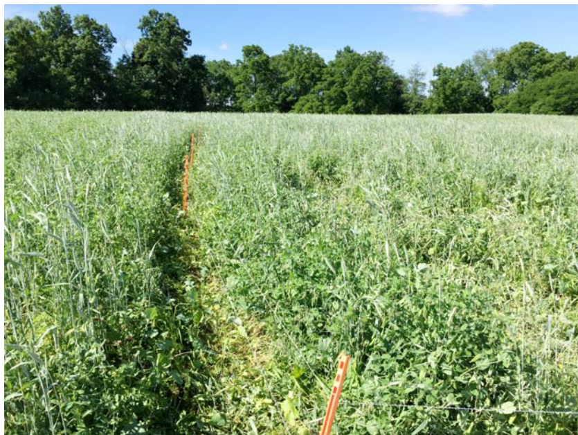
A diverse pasture mix of rye, peas, and brassicas builds healthy soil and provides high-quality forage.

And when you add a well-managed grazing plan to the system, you get the benefit of animal impact that contributes organic matter and biology to the soil system. Increases in soil aggregation, organic matter, and diversity buffer soil temperatures, preserve water, and minimize soil compaction. In short, the functionality of your soil improves.