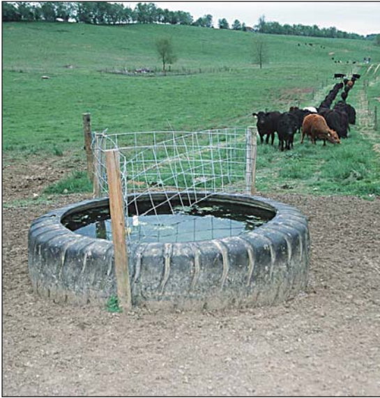
Water sources should be strategically placed to ensure animals have access from each paddock in the grazing cell. This permanent water source allows access from a lane that leads to successive grazing paddocks.

Heavy livestock traffic around ponds, springs, or streams can destroy vegetation. Piping water away from these sources or limiting animals' access results in higher-quality water for them, and it benefits wildlife habitat. Some producers report economic benefits from providing cool, high-quality water, though little research exists.