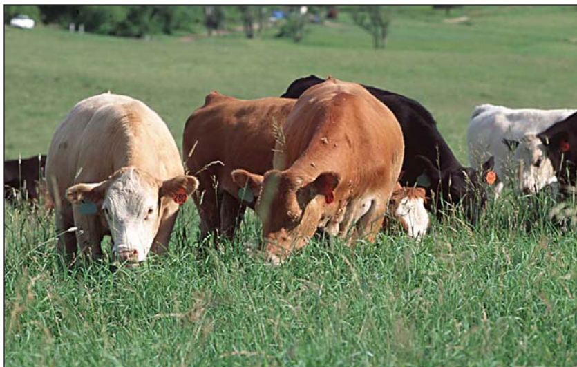
Rotational grazing systems provide producers with the ability to match available forage to daily livestock forage demand, resulting in increased productivity and the maintenance of resilient pastures.

The Natural Resources Conservation Service (NRCS) has grazing specialists in each state to help farmers improve their grazing management. Your county NRCS office can refer you to the grazing specialist in your area.