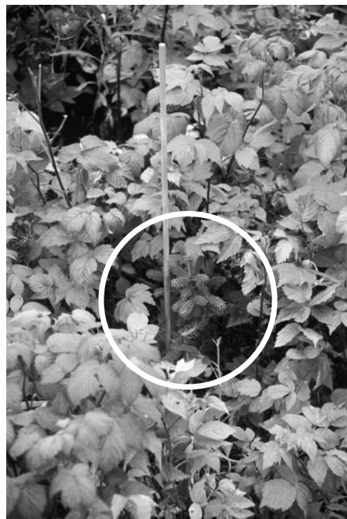
Figure 1.—This spruce seedling is being outcompeted by surrounding vegetation.

Burning also can reduce slash and brush competition, but fire can be difficult to