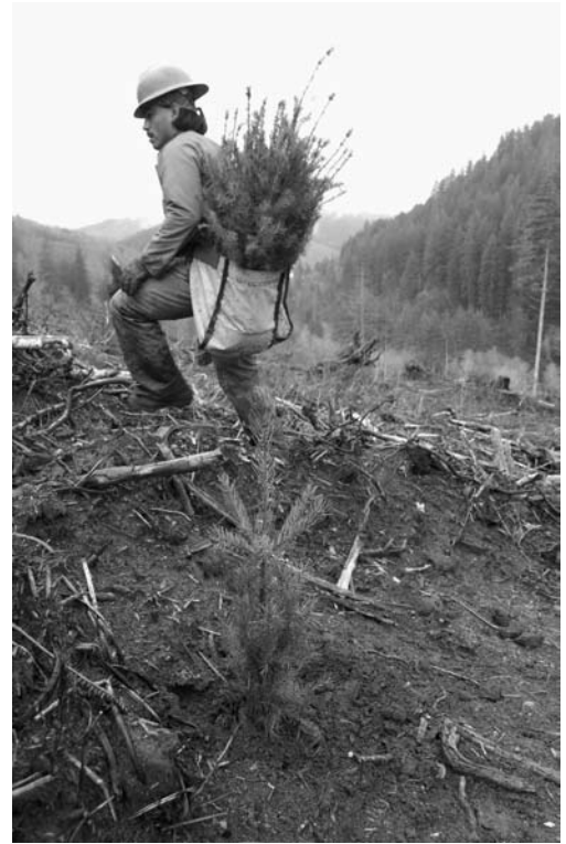
LYNN KETCHUM, OREGON STATE UNIVERSITY

*Stocking is the number of trees in a forest. Usually this is expressed as trees per acre or by some relative measure, such as well stocked, fully stocked, overstocked, understocked.