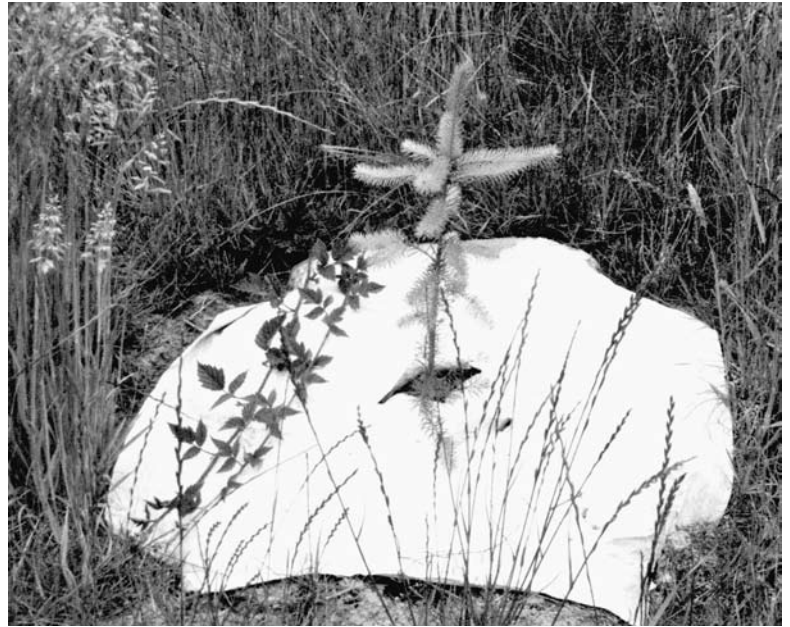
Figure 2.—Mats effectively control competing vegetation, but they are expensive.

Natural seeding of new trees (natural regeneration) from remaining or nearby "parent" trees can be effective under the right circumstances. Species such as hemlock, alder, and lodgepole pine produce regular cone crops and regenerate rapidly