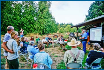
A composting workshop is presented at a recent WIGA potluck.

Are you a farmer on Whidbey? Join our monthly Whidbey Island Growers Association (WIGA) potluck to eat good food, network with other farmers, and hear talks relevant to farmers. Learn more at: