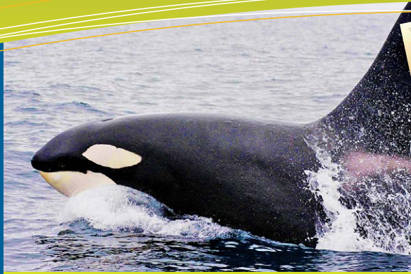
The Southern Resident Orcas are an icon of the West Coast, integral to the marine ecosystem, and among the most at-risk marine mammals in the world.